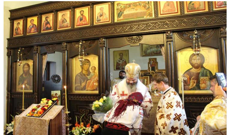
Romanian Orthodox Church, Long mile Road