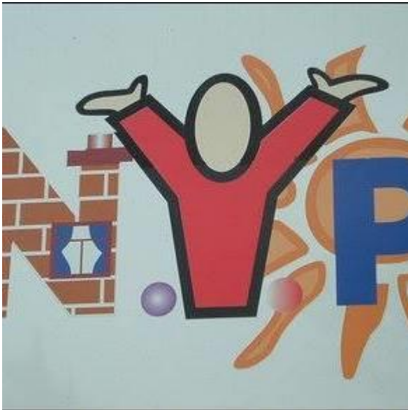
Blakestown and Moutview Neighbourhood Youth Project