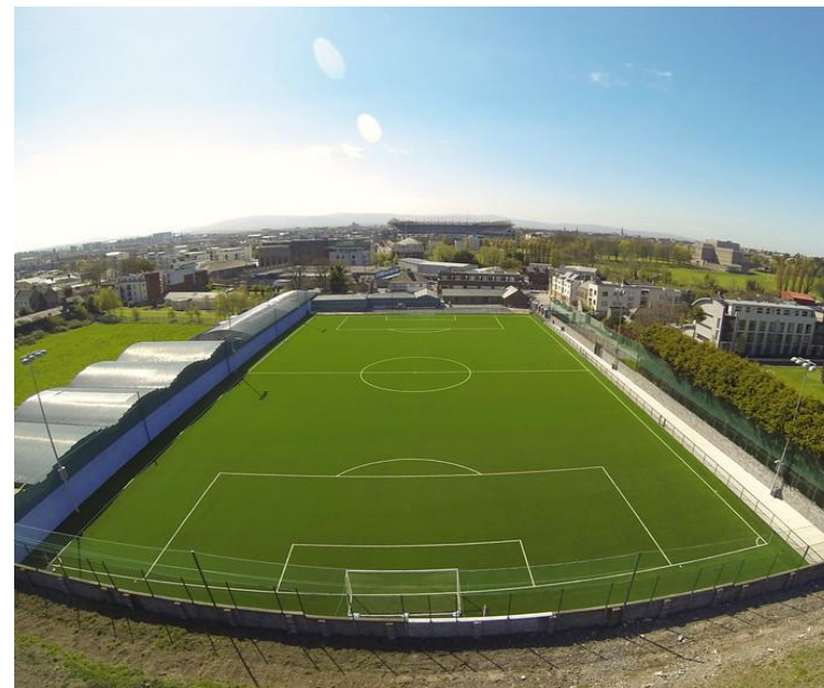
Stella Maris, Richmond Rd, Drumcondra