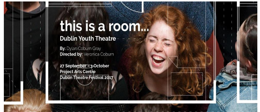
Dublin Youth Theatre – Gardiner St