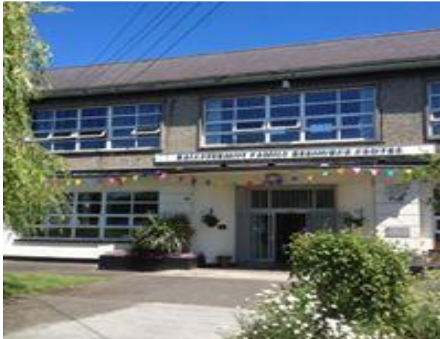
Ballyfermot Family Resource Centre