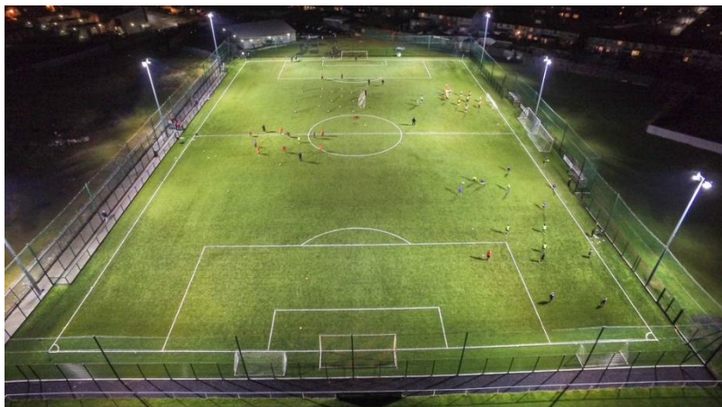
Cherry Orchard FC, Dublin