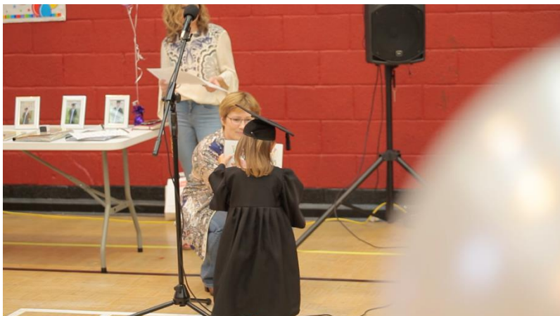
North Wall CDP - Sheriff Street