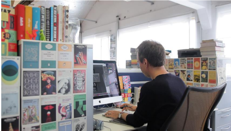
Filmbase, Temple Bar