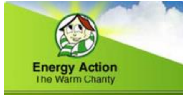
Energy Action Newmarket, Dublin 8